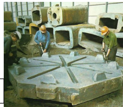
Multi-sources base plate