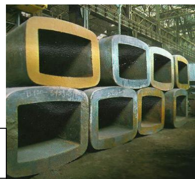
Ingot mould for 22 ton flattened ingot